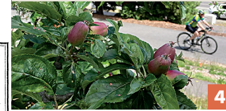
Burke-Gilman Trail & Orchard N PACIFIC ST & SUNNYSIDE AVE N