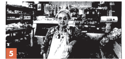
5 Lee's Grocery 3911 CORLISS AVE N

After the opening of the Ship Canal in 1917, 23 waterways were built around the lake to enable access to the water. Waterway 15 features a small park that celebrates the area's Indigenous and maritime history.