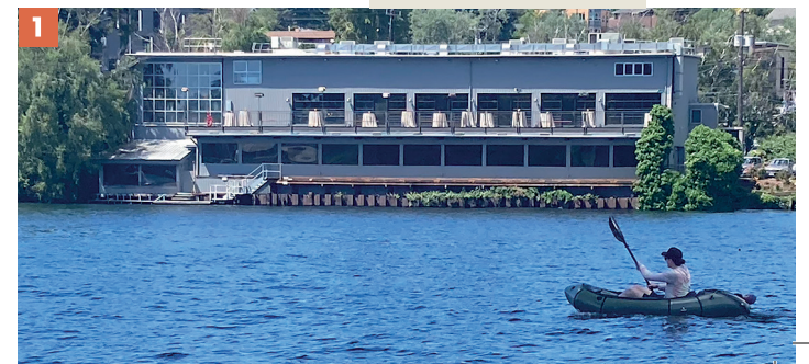
Chihuly's Boathouse 509 NE NORTHLAKE WAY

This unassuming boathouse is home to the studio, hotshop, and display space for famed glass artist Dale Chihuly. Works of art can be seen from or across the water.