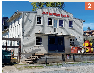
Freeway Hall 3815 5TH AVE NE

This former warehouse was at the center of Seattle's progressive political movement from 1963 to 1985. It was the world headquarters of the Freedom Socialist Party and Radical Women, a feminist socialist organization.