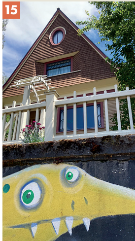
Henry Mural & Residence 3428 WOODLAWN AVE N