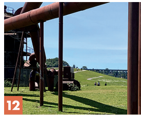
12 Gas Works Park 2101 N NORTHLAKE WAY

This former gasification plant used coal to produce gas for city lighting, heating, and cooking. Landscape architect Richard Haag reimaged it as a park in the 1970s, keeping many of the gas works structures.