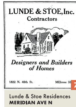
Lunde & Stoe Residences MERIDIAN AVE N