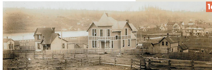
Waterway 15 4TH AVE NE & NE NORTHLAKE WAY